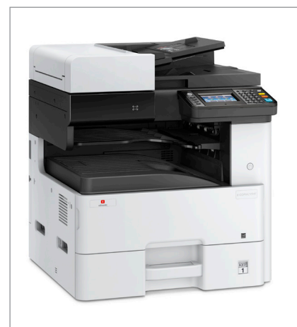
d-Copia 255MF in standard configuration