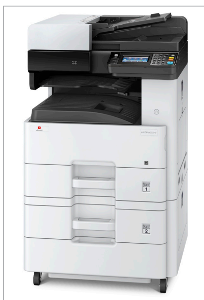
d-Copia 255MF with optional PF-470 drawer