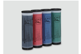
RISO INK FII Type Colour (1000 ml)

The RISO i Quality mark indicates a RISO product compatible with the RISO i Quality System.