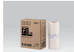
RISO MASTER FII Type (A4: 295 sheets)