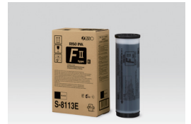
RISO INK FII Type Black (1000 ml)